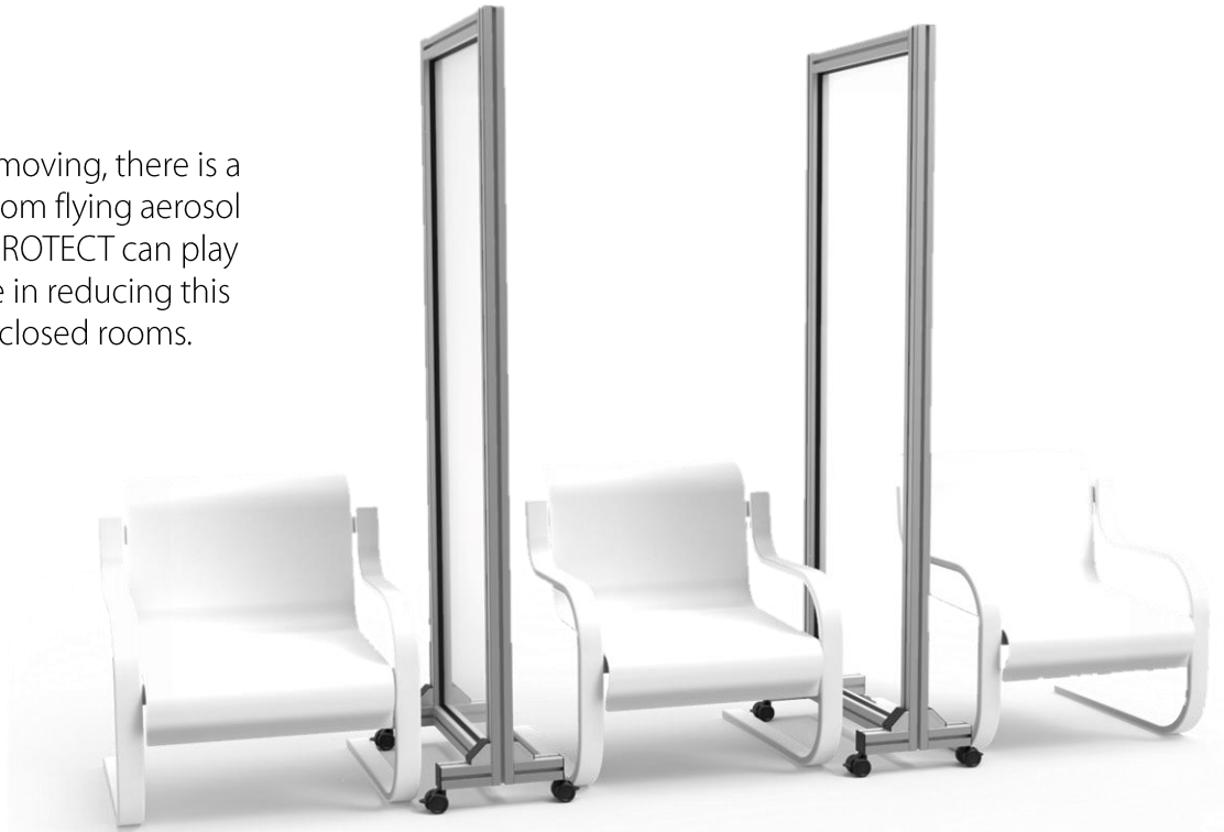
Example: waiting room

Even without us moving, there is a risk of infection from flying aerosol droplets. modu-PROTECT can play an important role in reducing this risk, especially in closed rooms.