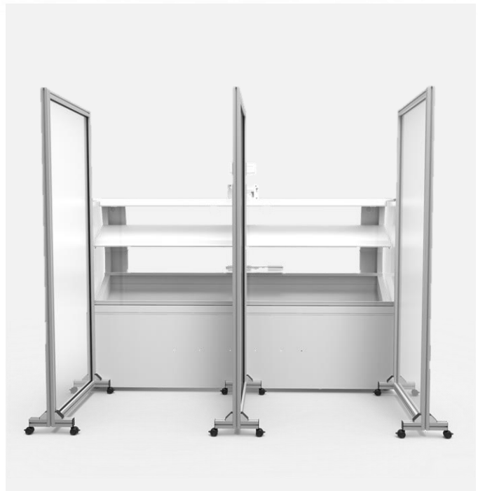
Example: selling counter