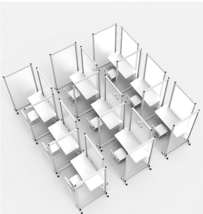
Example: seminar room / classroom