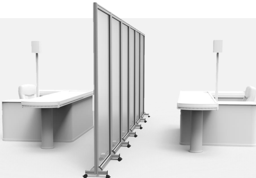
Example: supermarket cash registers

All elements are provided with casters so they can be easily moved to the desired location. Afterwards, casters can be locked to prevent undesired shifting.