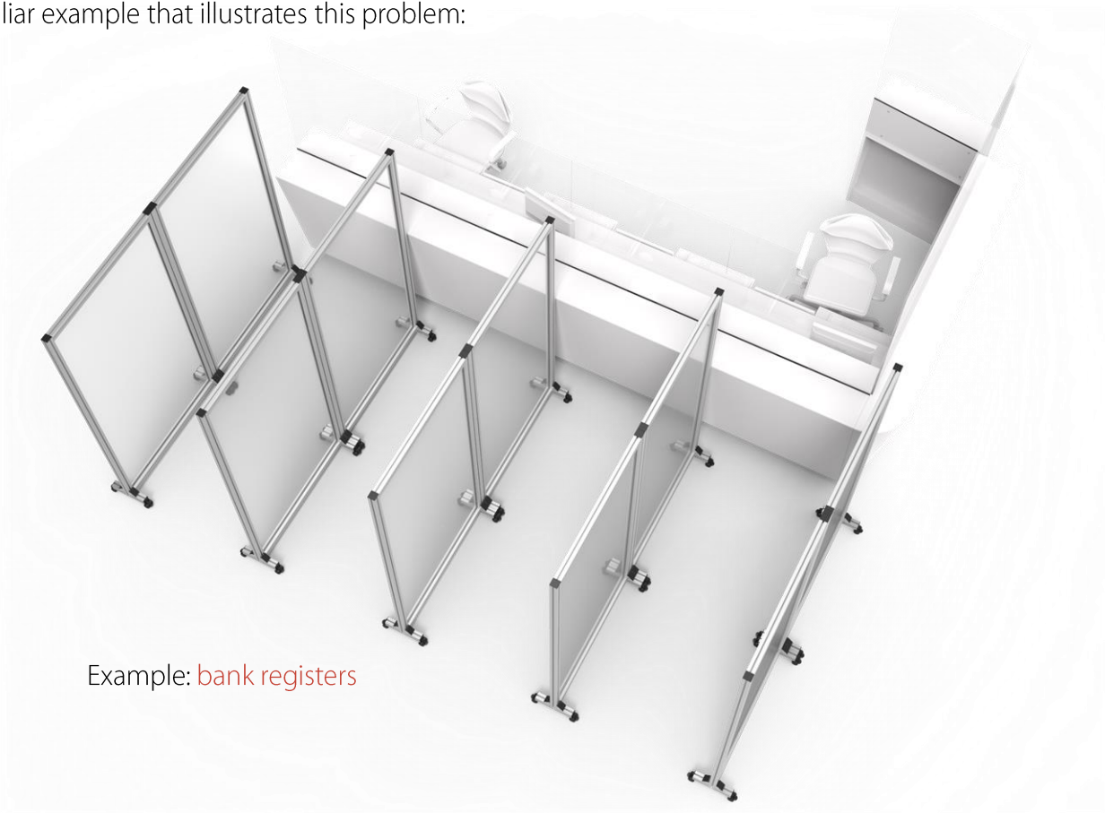
Example: bank registers

Organizing crowds and separating them from each other can be a huge challenge, especially when it needs to be done on a daily basis. Queues are a familiar example that illustrates this problem: